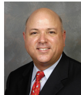
Miguel Viyella Chair